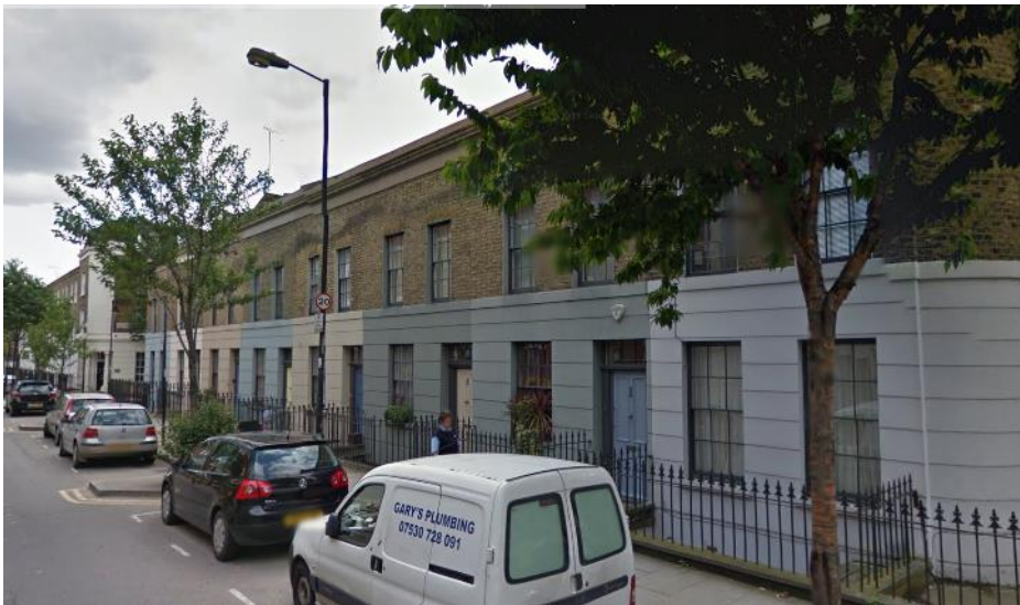
Image 1: Front elevation of the locally listed terrace at Wharfdale Road looking east