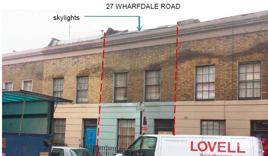
Photo 3: View taken from the submitted Design and Access Statement