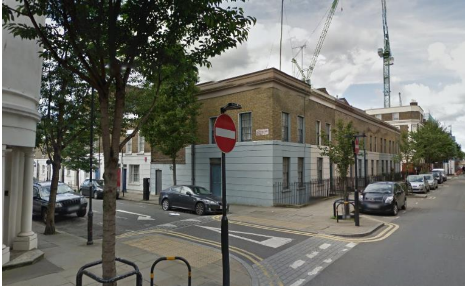
Image 2: View towards the terrace from the junction with Northampton Street